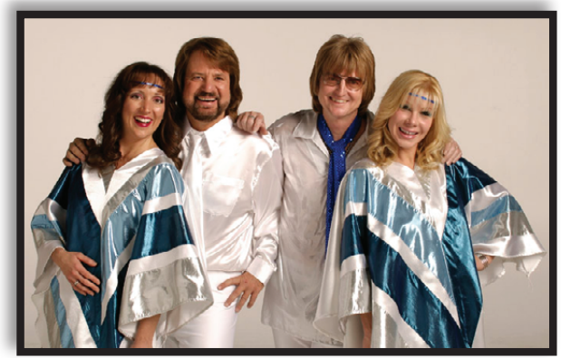
FRIDAY, APRIL 26, 2024 - 7:30 PM

There has been a resurgence of ABBA in the hugely popular live musical production and movie "Mamma Mia". The music of ABBA is finding its way back into the hearts of those who lived it and loved it in the 1970s, and those experiencing it for the first time now. Abbacadabra's show is authentic in music and dress, and is performed to live music. You'll think you have stepped back in time when you hear them sing Fernando, Chiquitita, Dancing Queen and so many more.