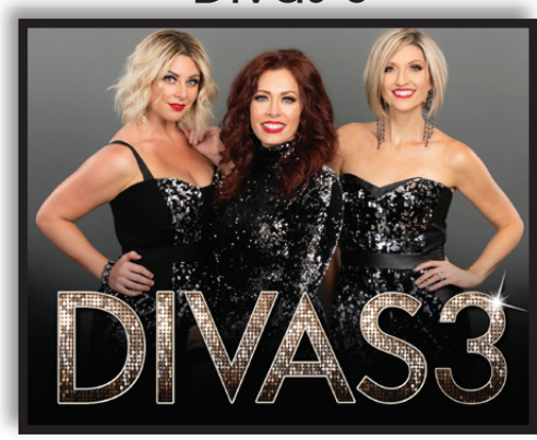
SUNDAY, MARCH 17, 2024 - 7:30 PM

Three female singers with powerhouse voices sing the biggest hits of the greatest divas in music history. This vibrant show spans four decades covering the 1960s through the 1990s with hits by Aretha Franklin, Carole King, Celine Dion, Whitney Houston, Cher, Dolly Parton, Donna Summer, ABBA, and many more! Individual members of the group have all starred in shows on the Las Vegas Strip. Since its inception in 2013, the group has gone on to perform at performing arts centers across the United States, and internationally as a headlining entertainer act aboard luxury cruise ships.